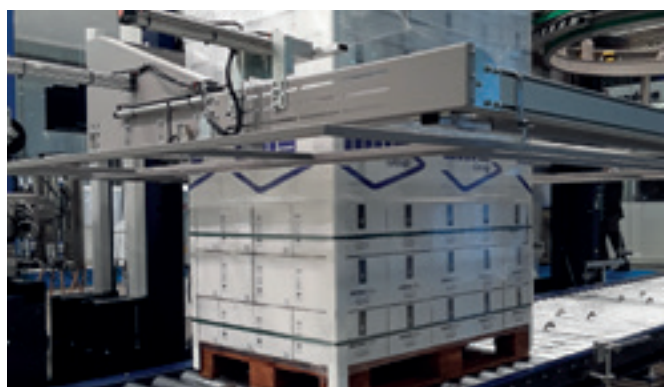
Strapping arch detail