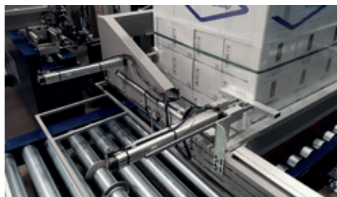
Corners protection device