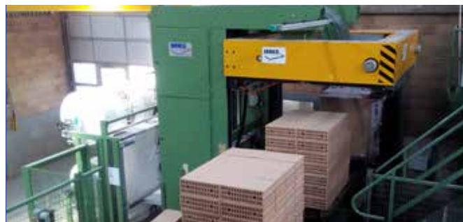
Machine in cycle into a bricks factory