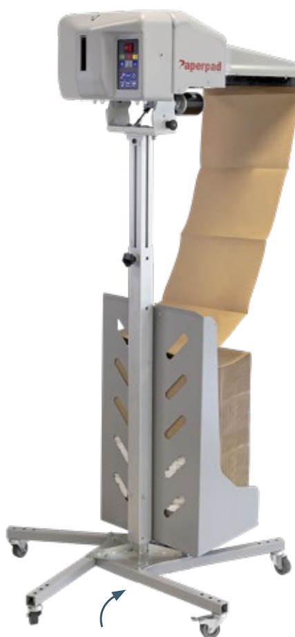
Movable stand with large paper pack holder