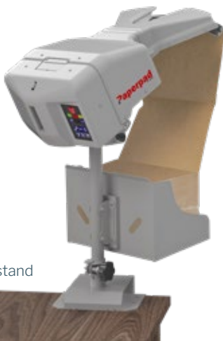
Table top stand

Paper loading is extremely simple and safe and can be done in no time.